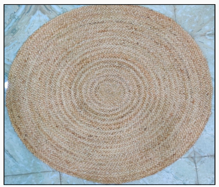
PRODUCT = MACHINE STITCHING JUTE BRAIDED RUGS MATERIAL = 100% NATURAL JUTE SIZE = 90CM SHAPE = ROUND WEIGHT = 1.45 KG RATE = PRODUCT CODE = MS-01