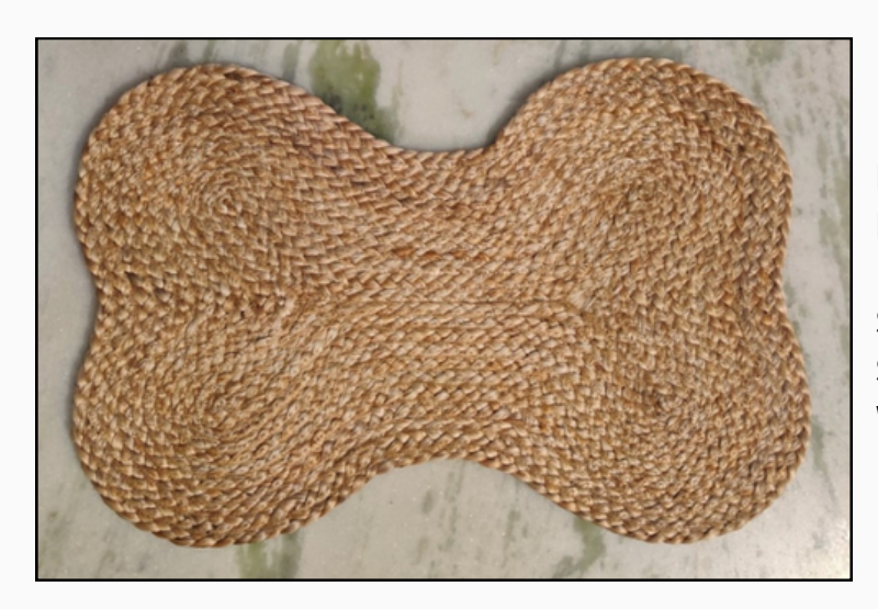
PRODUCT = MACHINESTITCHING JUTE BRAIDED PLACE MAT MATERIAL = 100 % NATURAL SIZE = 35 X 45 CM SHAPE = BONE WEIGHT = 300GM RATE = PRODUCT CODE = MSR-02